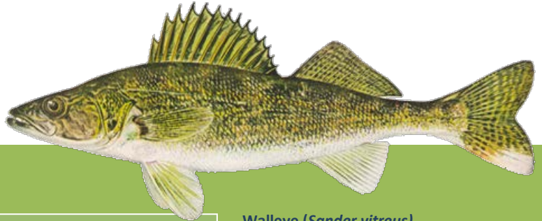
Walleye ( Sander vitreus )